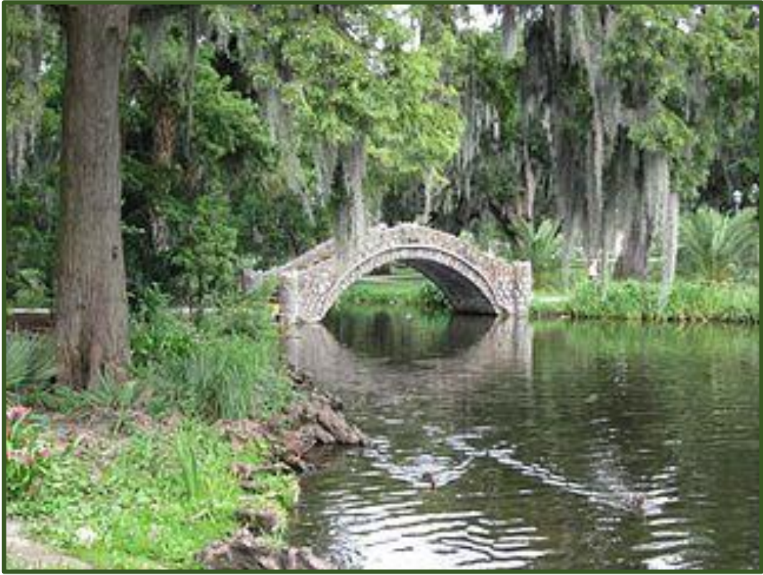
New Orleans, LA