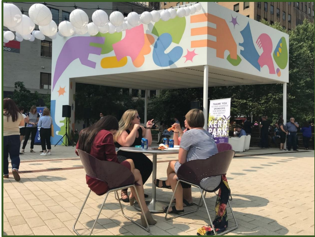
Oklahoma City, OK