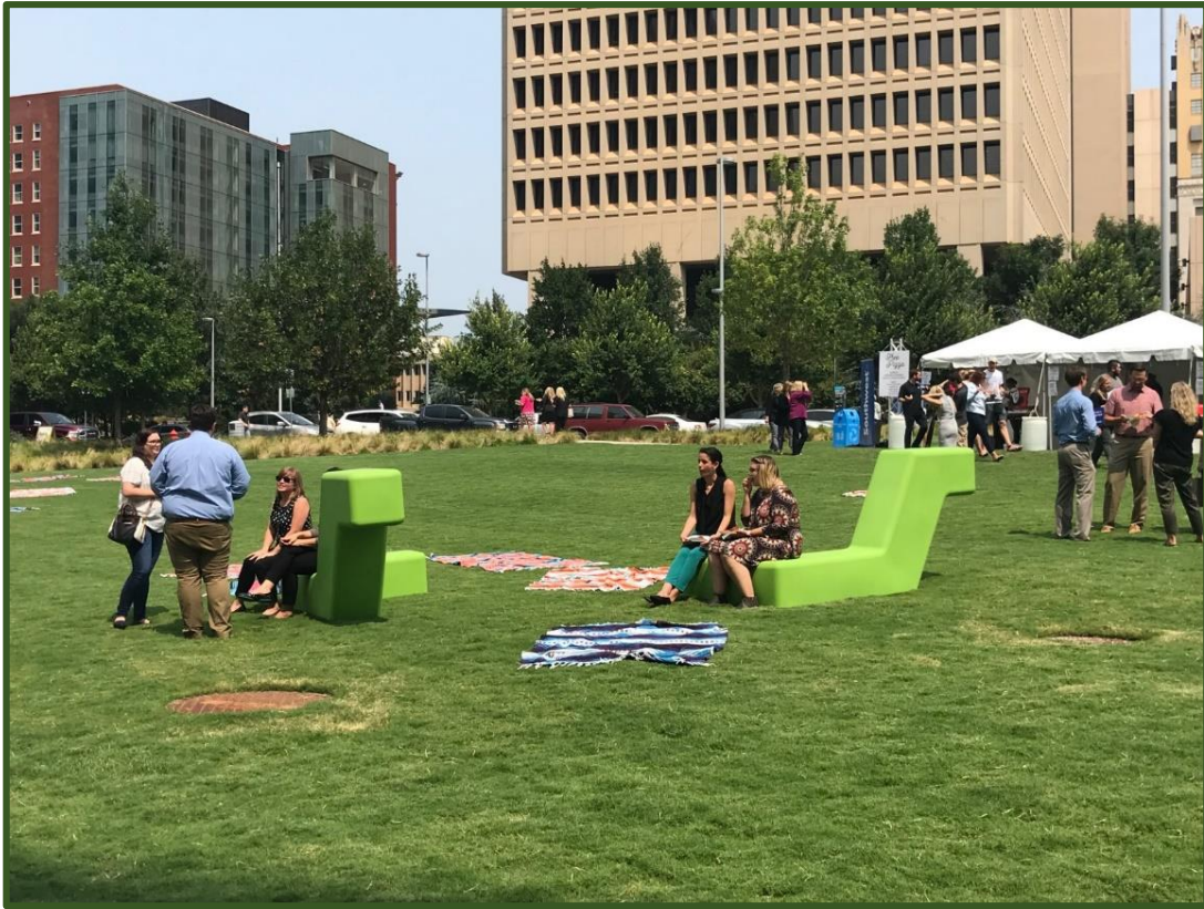
Oklahoma City, OK