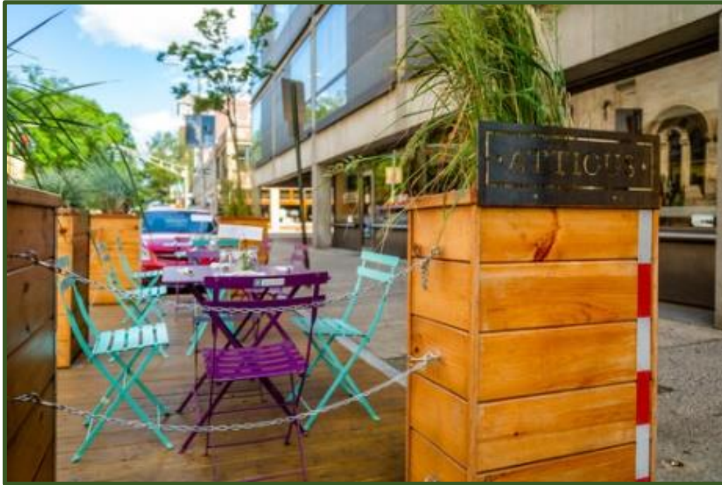
New Haven, CT