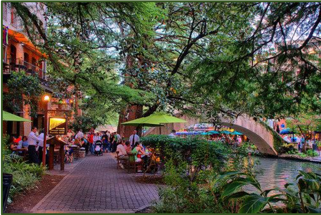
San Antonio, TX