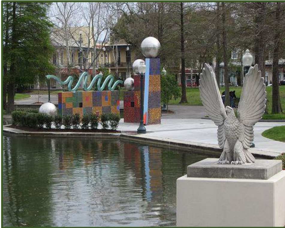
New Orleans, LA