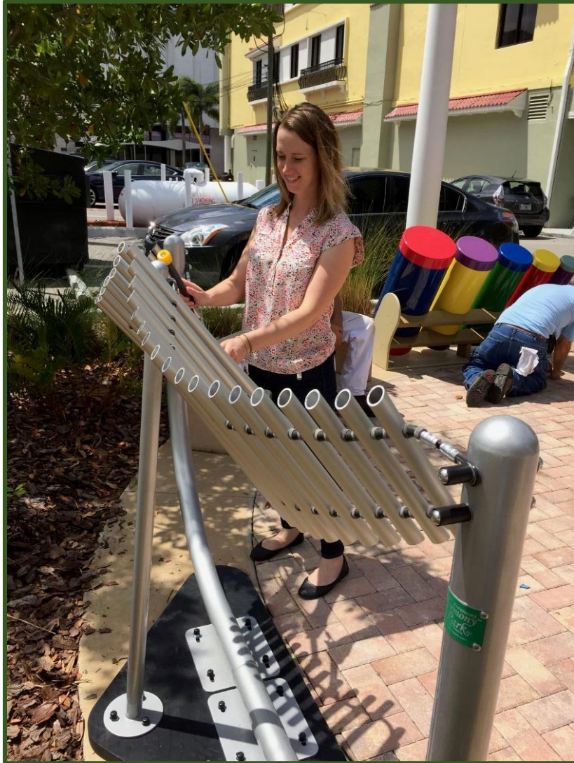
Fort Myers, FL