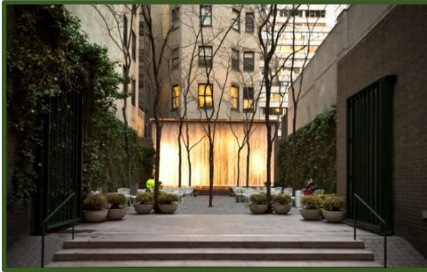
New York City, NY