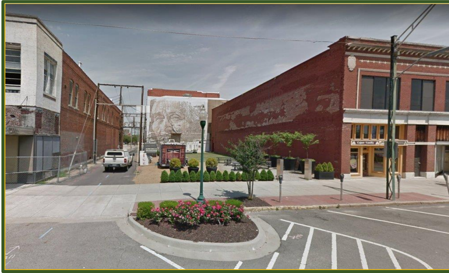
Fort Smith, AR